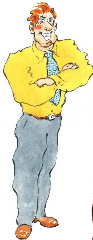
The Superheroes Wonder Woman and Superman