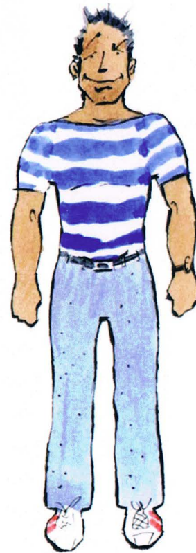
The Heroes Warrior and Huntress