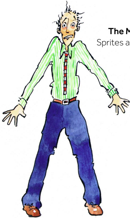
The Magicals Sprites and Wizards