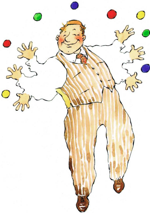
The Guardians Good Fathers and Earth Mothers